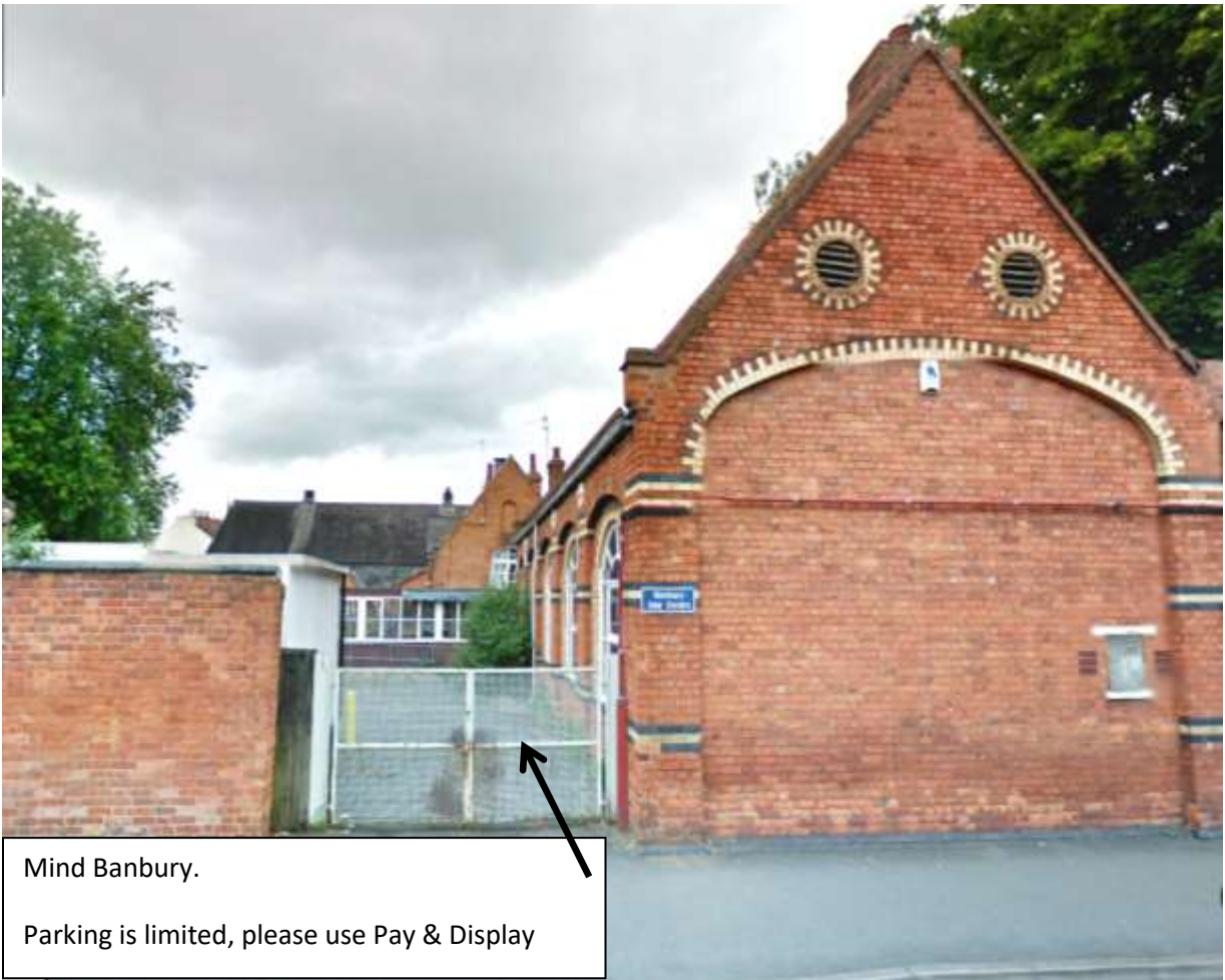
Mind Banbury. Parking is limited, please use Pay & Display