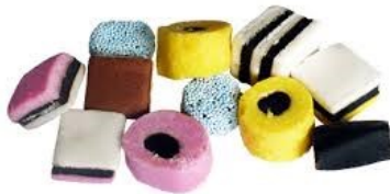
100g liquorice allsorts