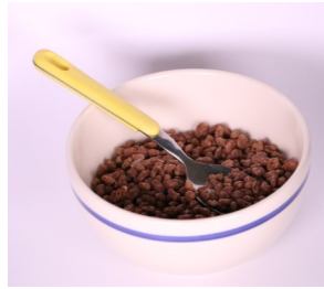
50g serving of chocolate puffed rice cereal (not incl. milk)