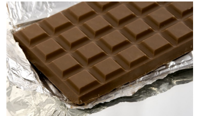
100g milk chocolate