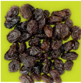
100g of raisins