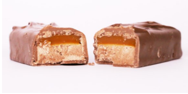
51g bar of chocolate coated caramel and nougat bar