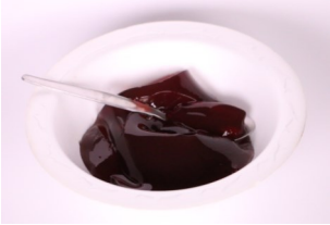
175g of low calorie fruit flavoured jelly